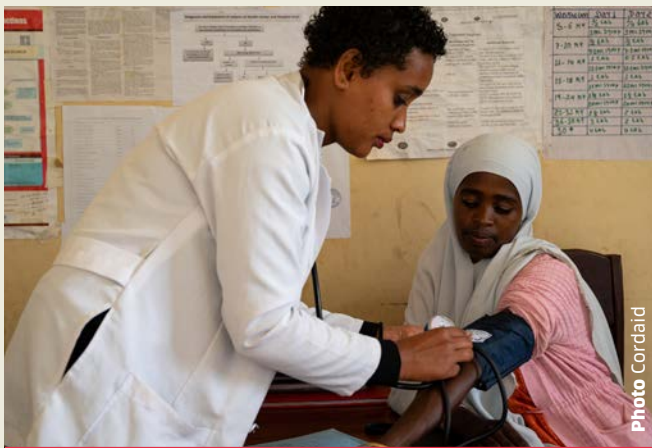
Patient gets health check in a Jimma Health Centre implementing PBF.