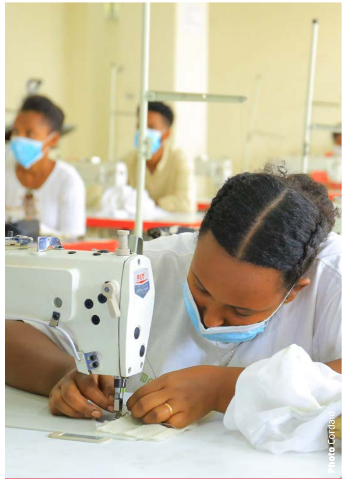
Youth participating in the JSE project in Bahir Dar.

Read more on the Cordaid Ethiopia website .