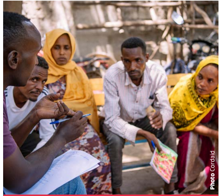
Smallholder farmers meet as part of the STARS project

Read more on the Cordaid Ethiopia website .