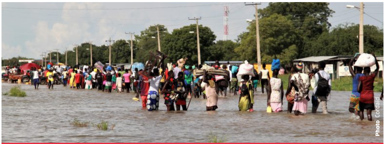
People seeking safer grounds after the Nile River banks burst in Bor, South Sudan.

“ If we fail, we will exacerbate climate and conflict risks. If we succeed, we can create synergies and greater impact.”