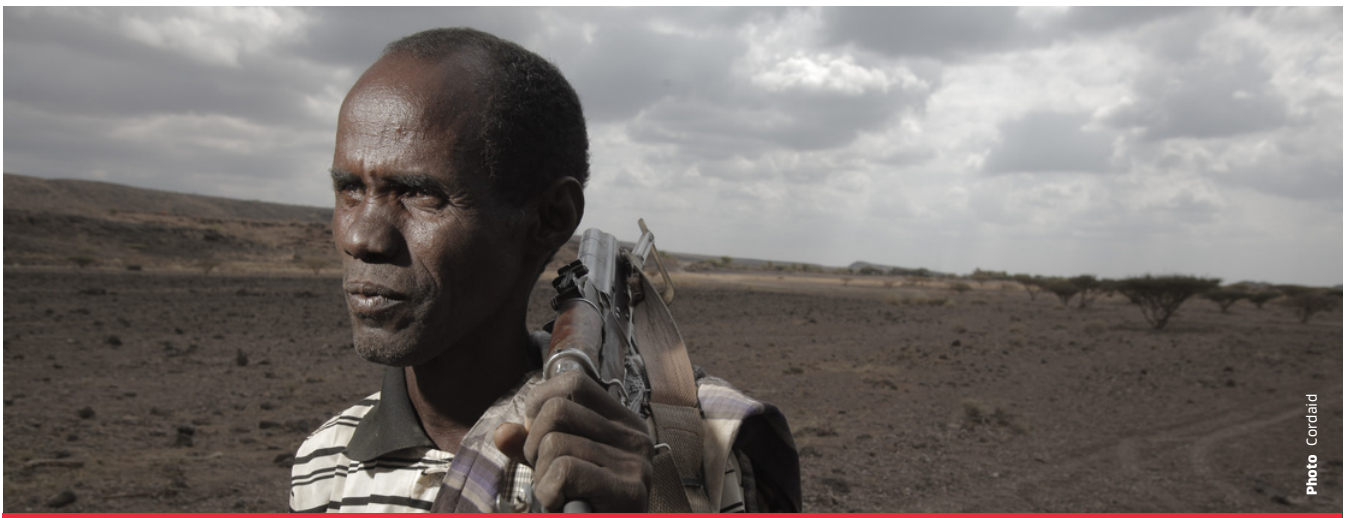
Natural resource scarcity contributes to insecurity in Ethiopia.

Both Cordaid and CSPPS have endorsed the Peace@COP28 statement calling for accelerating climate action in communities affected by conflict and consider the successful implementation of the Paris Agreement to only be possible with a conflict-sensitive and peace-responsive approach. At COP28, policy makers must put peace, conflict prevention and conflict sensitivity on the agenda.