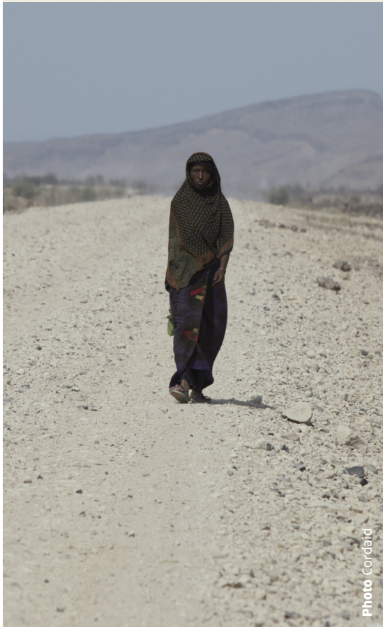
Ethiopians flee drought.

Via FairClimateFund , a subsidiary of Cordaid we join the global campaign 'A Fair Race to Net-Zero,' making sure that transition to a net zero carbon economy does not overlook the people that are most vulnerable to the impacts of climate change.