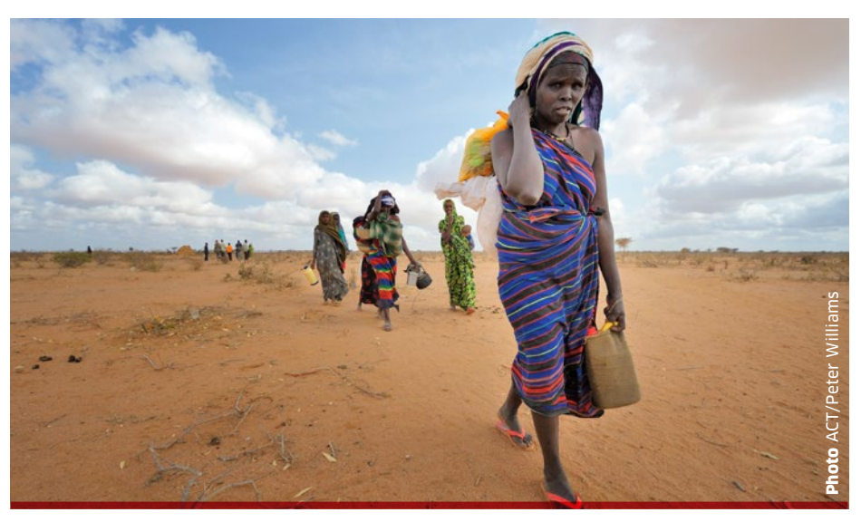
Somalis flee drought.